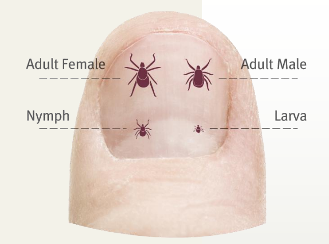
Illustration is only indicative. Sizes can change considerably depending on tick species.